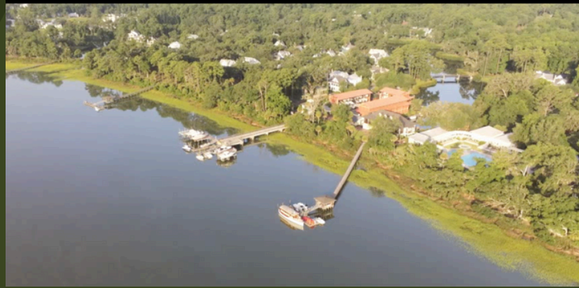
WILSON MARINA & CANOE CLUB