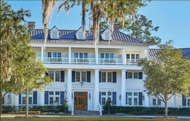
MONTAGE AT PALMETTO BLUFF