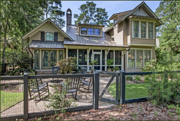
LOW COUNTRY ARCHITECTHURE