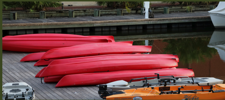
THE CANOE CLUB